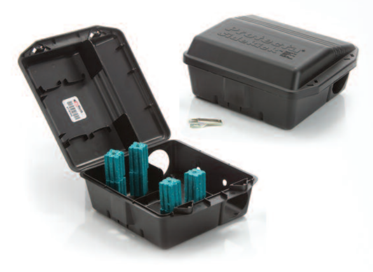
PACKAGING: 6 stations per case with bait securing rods & service cards