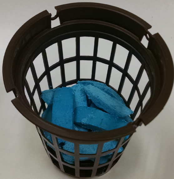
TOP VIEW Basket With Chunks

Includes: Basket, Bacterial Chunks and liquid cap holder