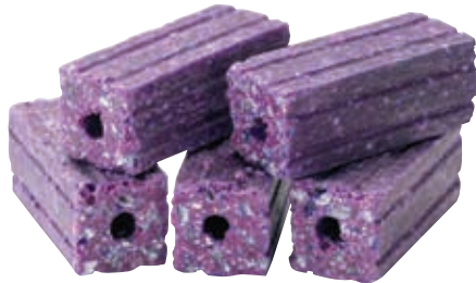
Photo is not representative of a label-consistent bait placement