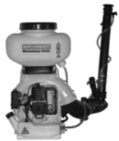
Microniseur B 245