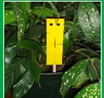
PLACE IN PLANT POT