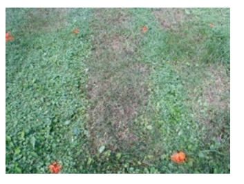
Ground ivy Sublime (14 DAT)