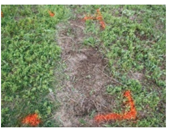
Oxalis Sublime (14 DAT)