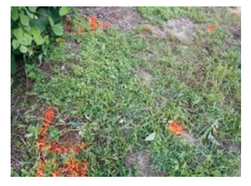
Oxalis Untreated check (14 DAT)