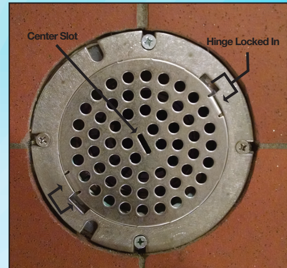
Top View With Cover Locked