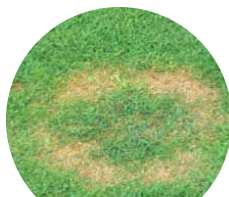
TAKE ALL PATCH