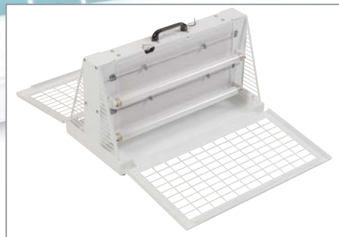
360° of light emission