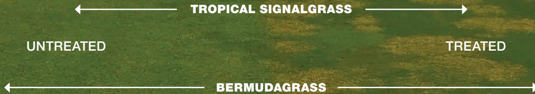
Photo taken October 27, 2017, 14 days after the first application of Manuscript and Adigor at the spot treatment rate. Performance assessments are based upon results or analysis of public information, field observations and/or internal Syngenta evaluations. Trials reflect treatment rates commonly recommended in the marketplace.

Representing a novel class of chemistry for turf, Manuscript is a highly active herbicide that controls mature grassy weeds in certain warm-season grasses on golf courses, residential and commercial lawns, sod farms and sports turf . With Manuscript, you can get the application flexibility you need to treat mature weeds. It can be used in the heat of summer when desired turfgrass is actively growing and will fill in rapidly, and is formulated with a built-in, proprietary safener to enhance performance and turf safety. Manuscript is packaged with Adigor™ surfactant from Syngenta, which is custom-built to be used with Manuscript to maximize the quantity and rate of absorption of pinoxaden , as well as the degree of translocation once pinoxaden is in the plant.