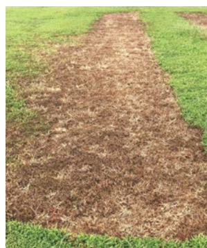
Surmise SpeedPro XT @ 6.4 fl oz/1000 sq ft