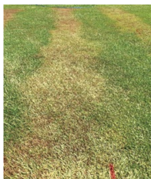
RM43 @ 7.4 fl oz/1000 sq ft