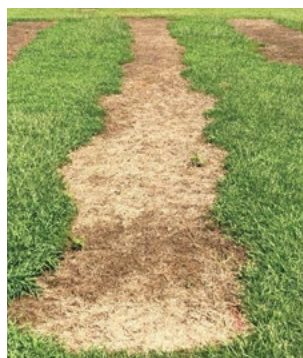
RM43 @ 7.4 fl oz/1000 sq ft