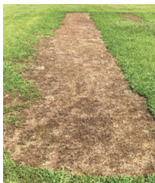
Surmise SpeedPro XT @ 6.4 fl oz/1000 sq ft