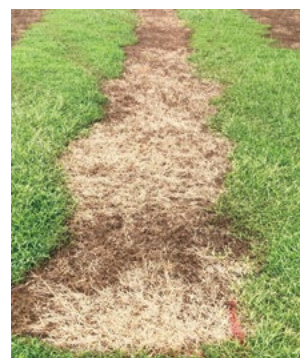
RM43 @ 7.4 fl oz/1000 sq ft