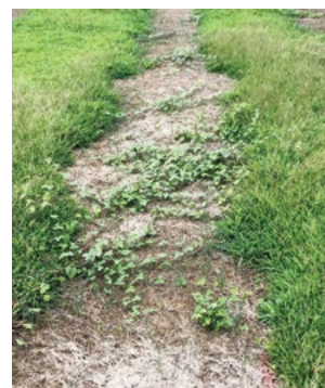
RM43 @ 7.4 fl oz/1000 sq ft