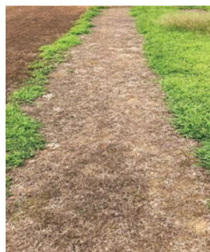
Surmise SpeedPro XT @ 6.4 fl oz/1000 sq ft