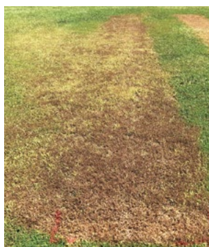
Surmise SpeedPro XT @ 6.4 fl oz/1000 sq ft