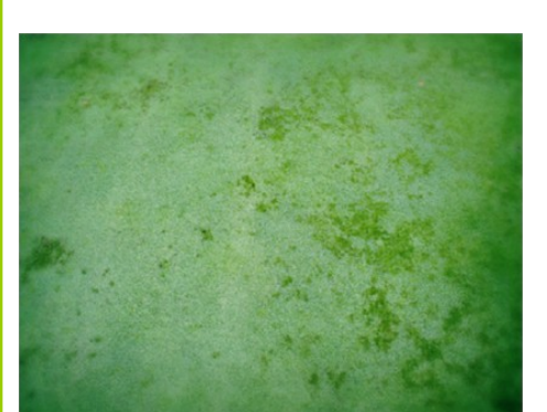
Before: Moss infestation on bentgrass putting green