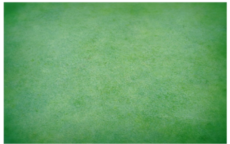
After: QuickSilver combined with sound agronomics provide an acceptable putting surface