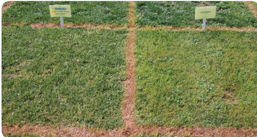
Tenacity 6.0 oz/A

Tenacity selectively controls yellow nutsedge in a new seeding of tall fescue (MD trial)