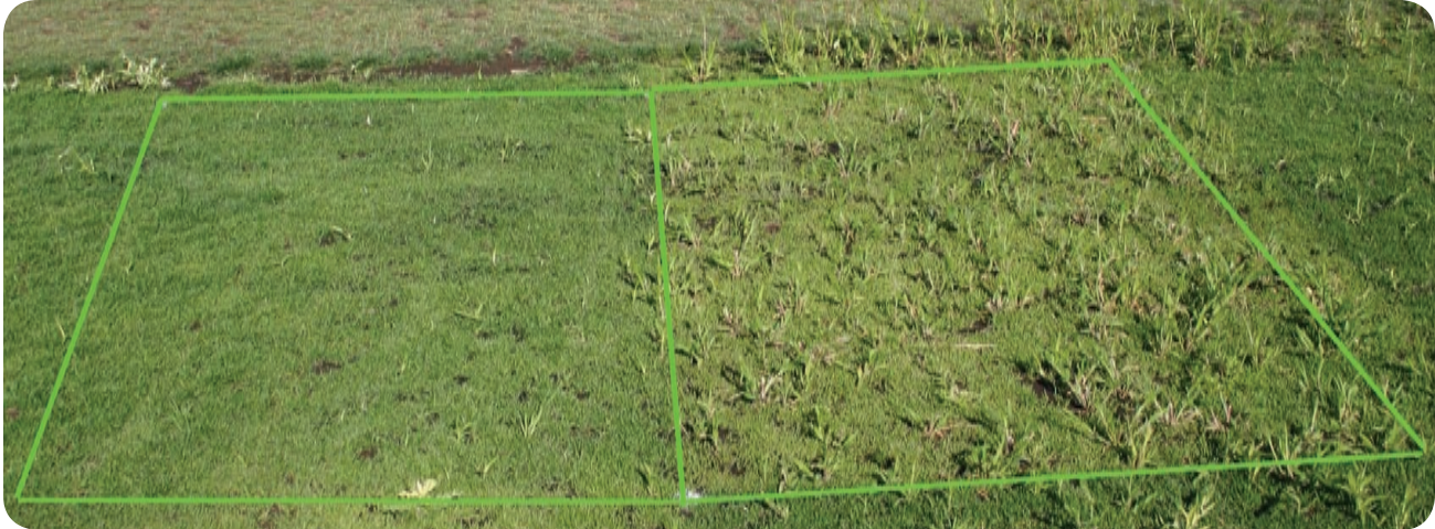
Tenacity 8.0 oz/A

Tenacity controls weeds when applied at seeding with turf safety. (WA trial) Spring seeding of Kentucky bluegrass.