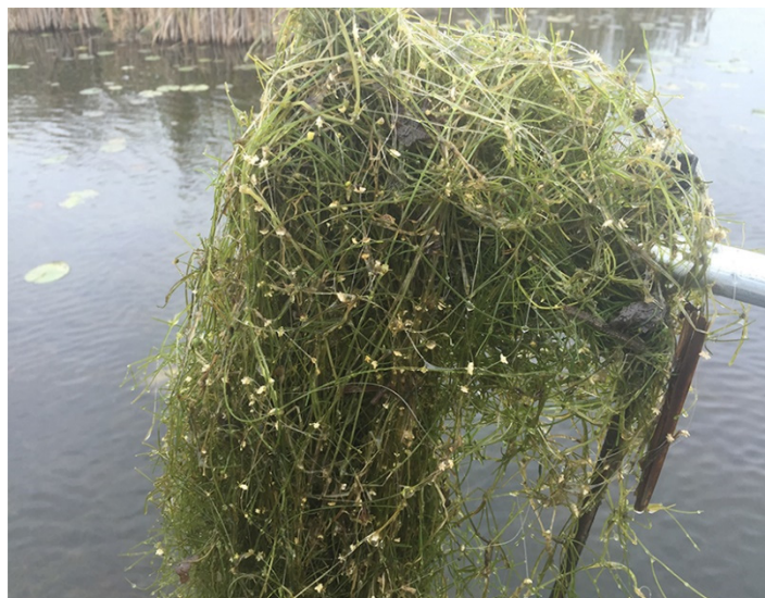
Figure 2. Field trials show efficacy controlling the nuisance plant Starry Stonewort.