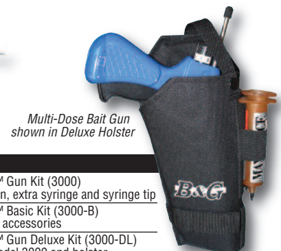
Multi-Dose Bait Gun shown in Deluxe Holster